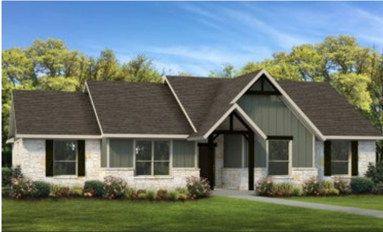
Elevation D | The Angelina