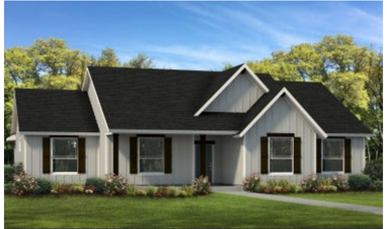
Elevation C | The Angelina