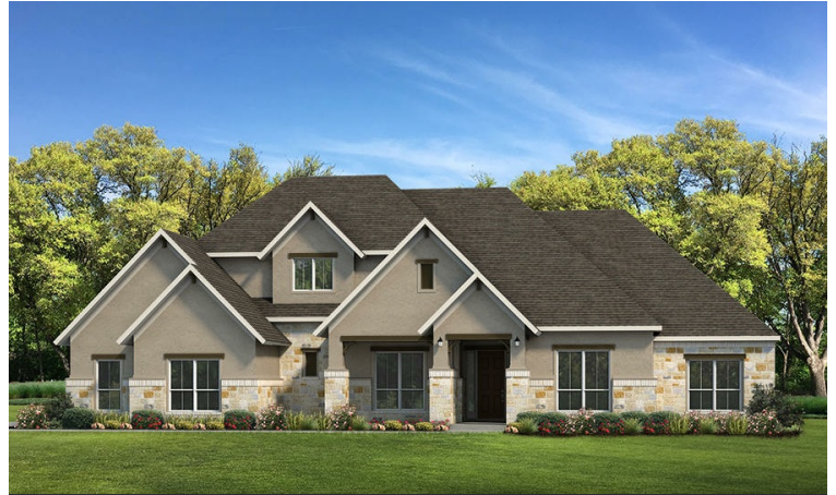
Elevation B - The Breckenridge