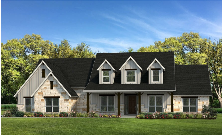
Elevation C - The Breckenridge