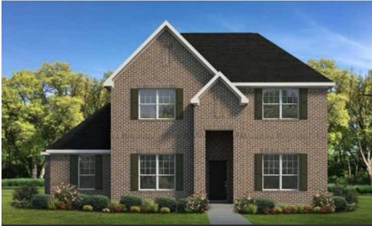
Elevation A | The Cedar Creek