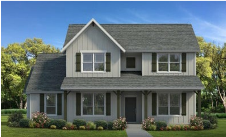
Elevation C | The Cedar Creek