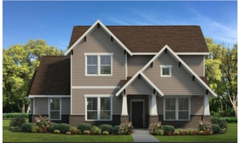
Elevation B | The Cedar Creek