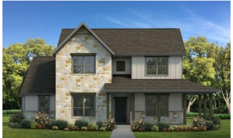
Elevation D | The Cedar Creek