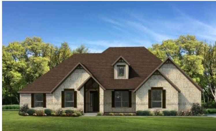
Elevation B - The La Salle