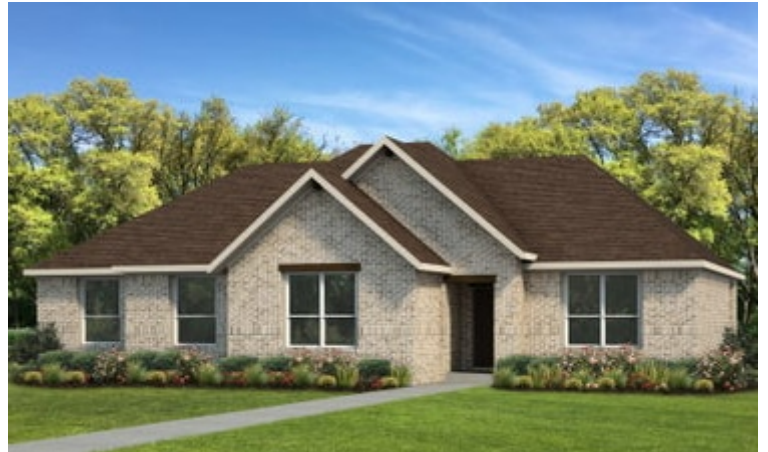
Elevation A | The Livingston