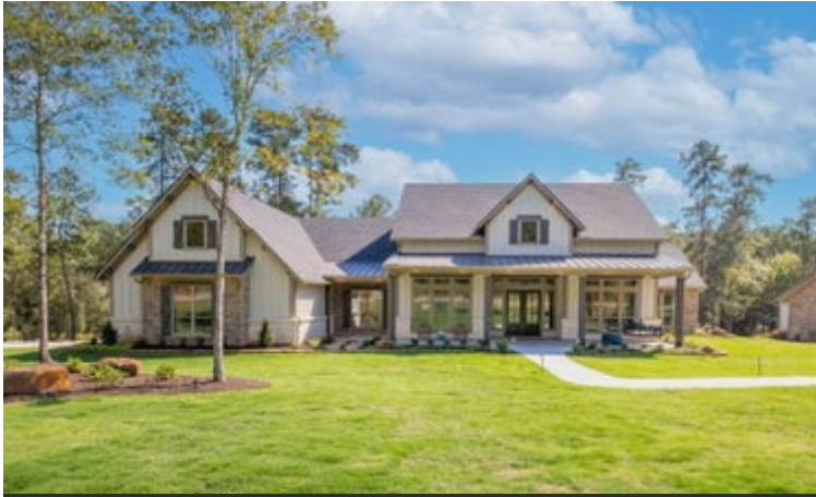
Model Home | The Lone Star C