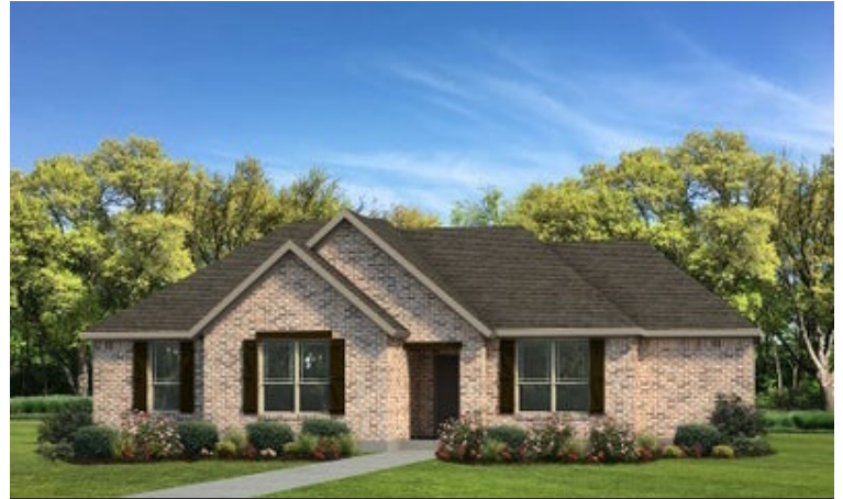
Elevation B - The Nacogdoches