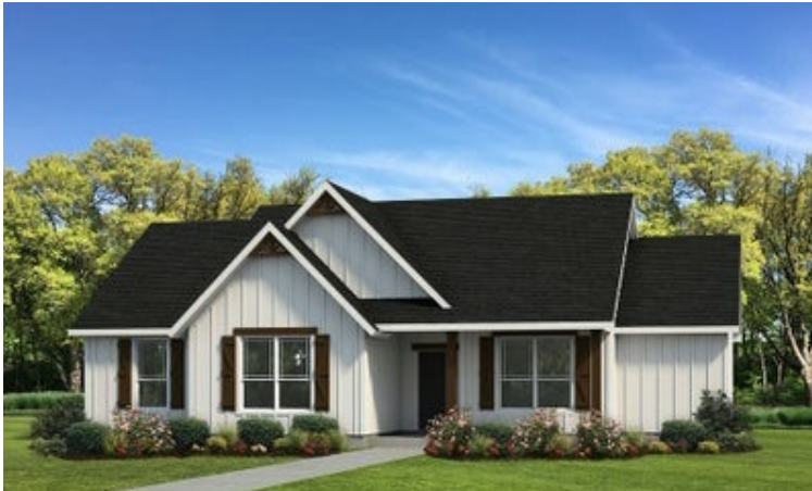
Elevation C - The Nacogdoches