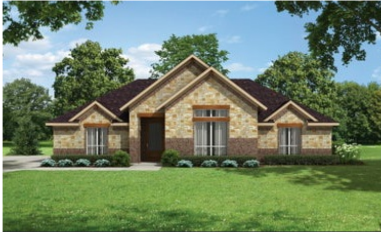
Elevation D - The Parker