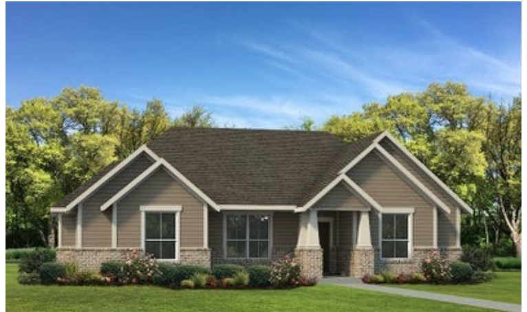
Elevation D - The Refugio