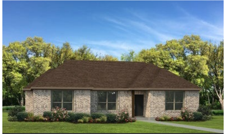
Elevation A - The Refugio