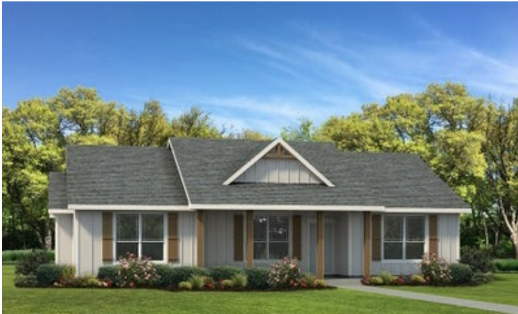
Elevation C - The Refugio