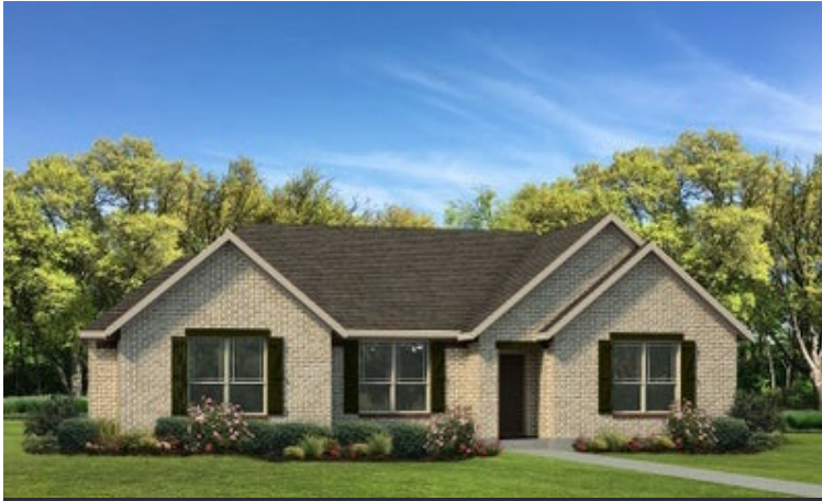
Elevation B - The Refugio