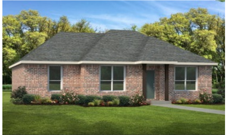
Elevation A - The Rio