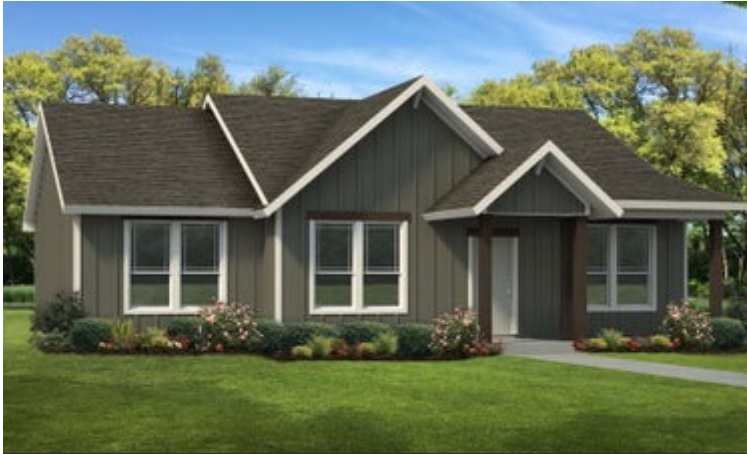
Elevation C - The Rio