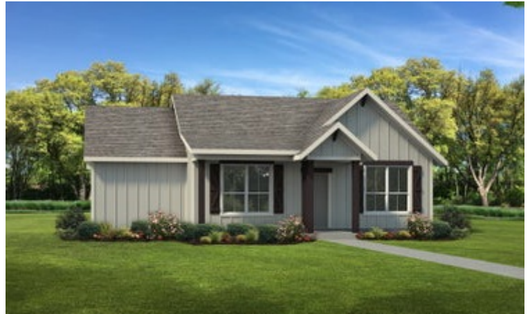
Elevation C - The San Antonio