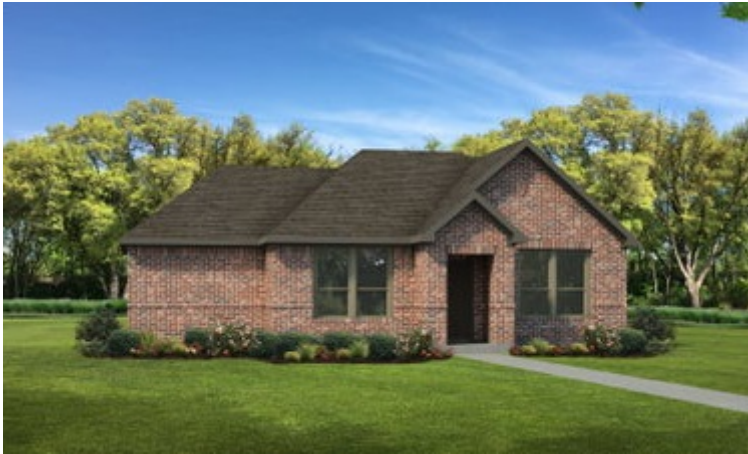
Elevation B - The San Antonio