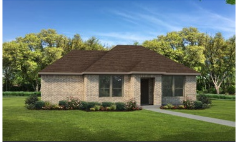
Elevation A - The San Antonio