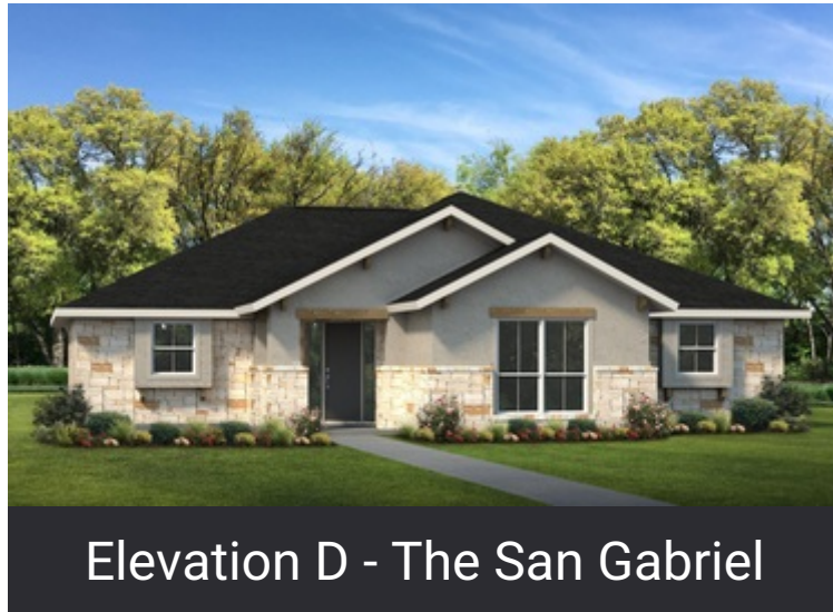
Elevation D - The San Gabriel