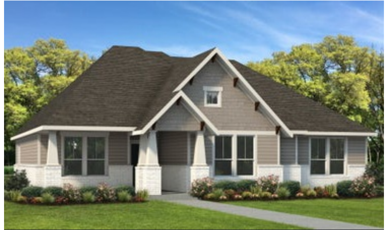
Elevation B | The Travis