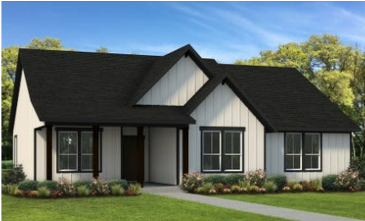
Elevation C | The Travis