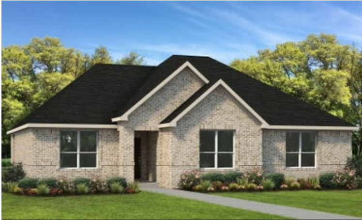
Elevation A | The Travis