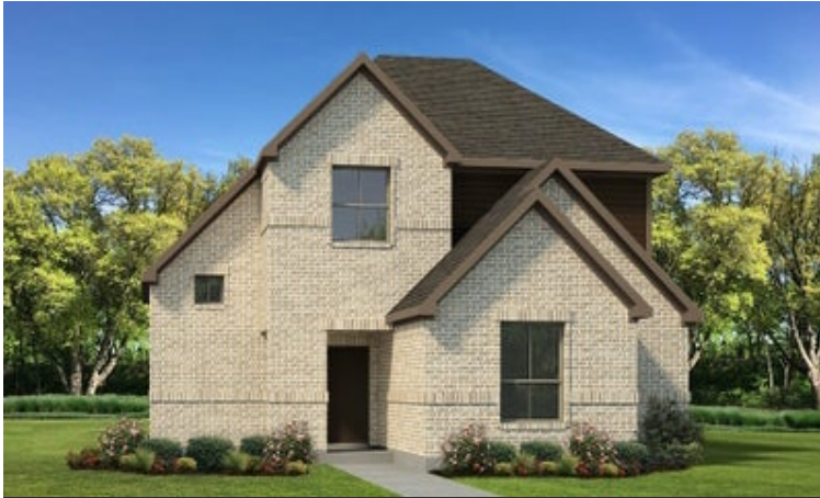
Elevation A - The Victoria