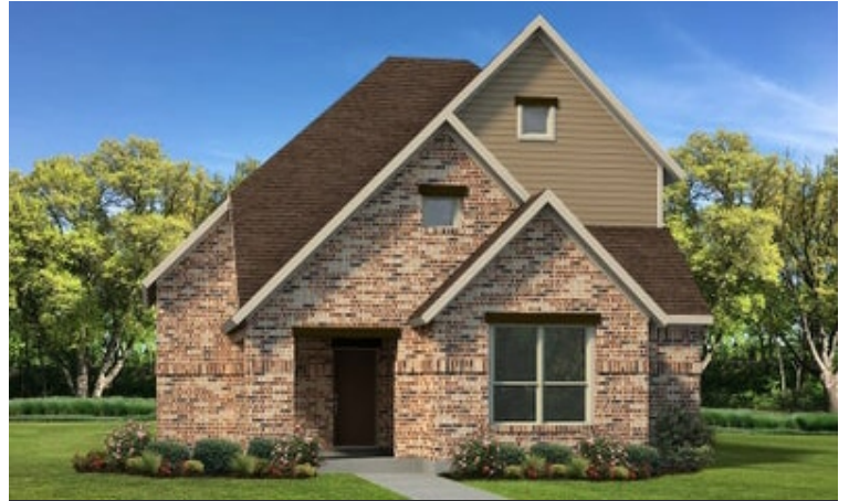
Elevation B - The Victoria