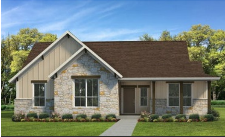
Elevation D - The Whitney