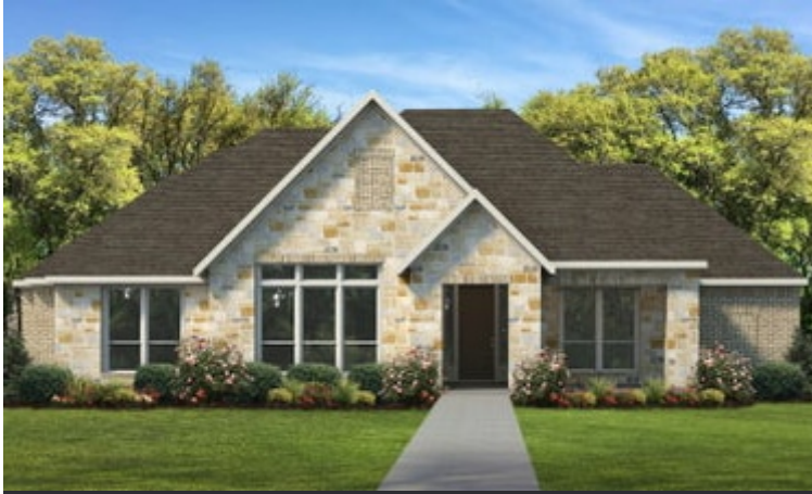
Elevation A - The Fayetteville