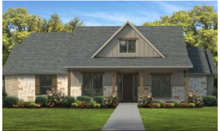
Elevation D - The Fayetteville