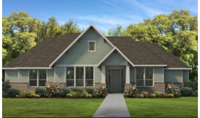
Elevation B - The Fayetteville