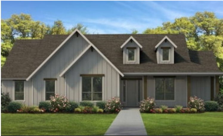
Elevation C - The Fayetteville