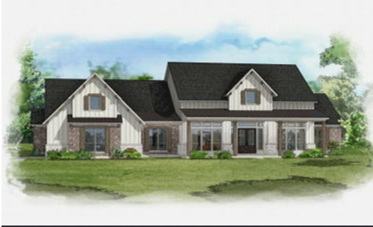
Elevation C | The Lone Star