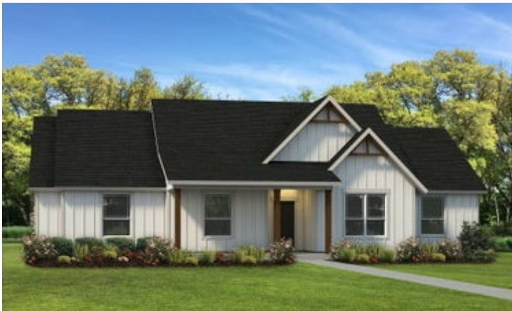
Elevation C | The Cisco