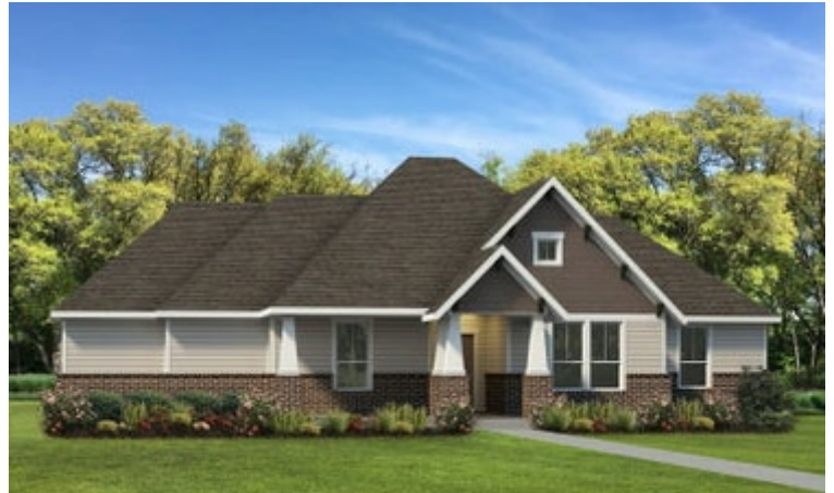
Elevation B | The Cisco