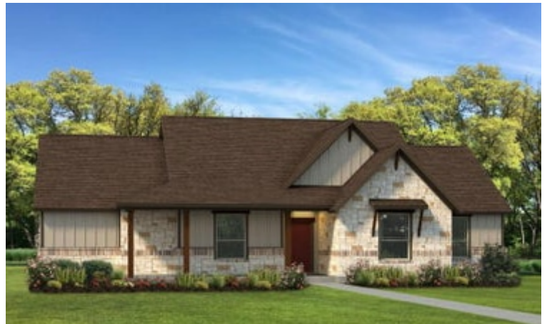
Elevation D | The Cisco