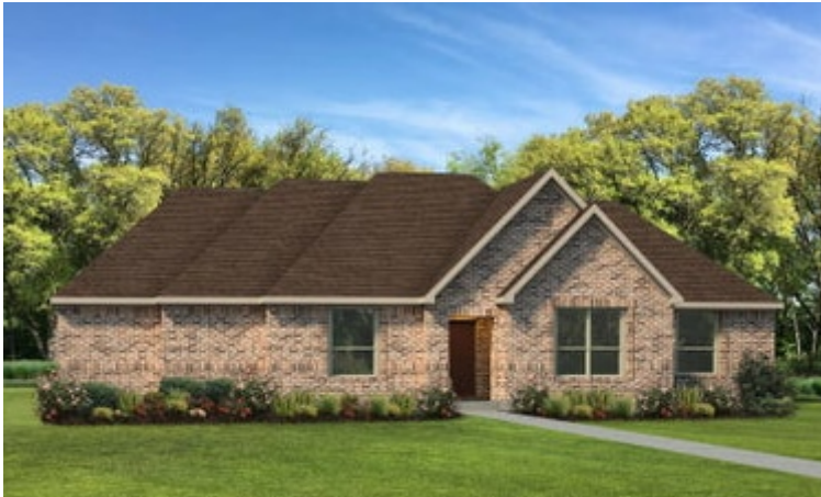
Elevation A | The Cisco