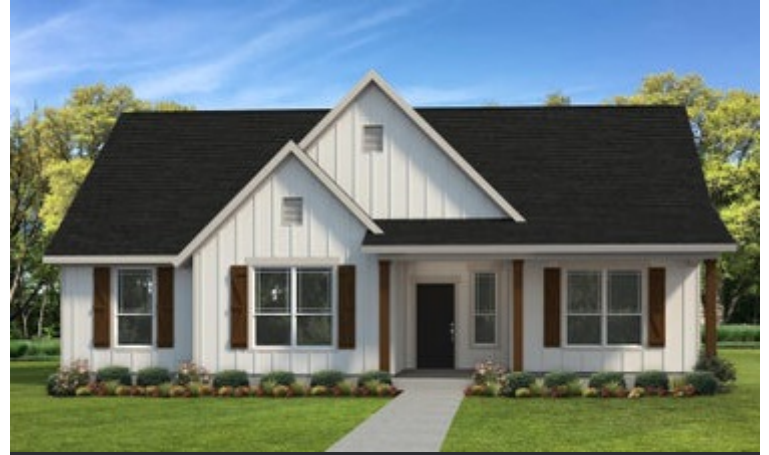
Elevation C - The Whitney