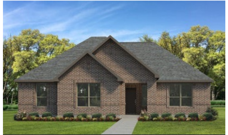
Elevation A - The Whitney