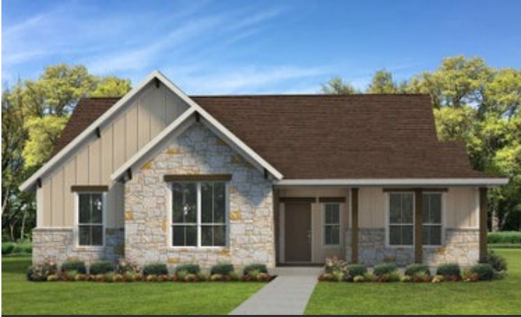
Elevation D - The Whitney