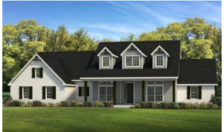
Elevation C - The Fredericksburg