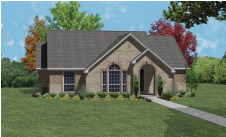
Elevation C - The Crockett