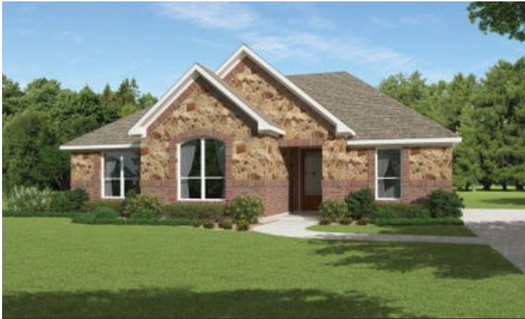
Elevation E - The Crockett