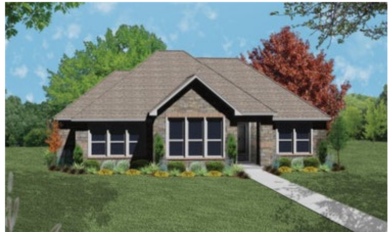
Elevation B - The Crockett