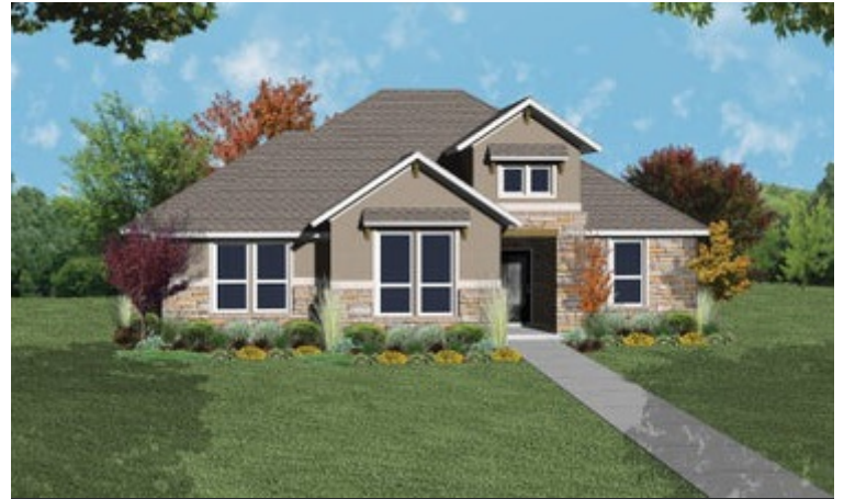
Elevation D - The Crockett