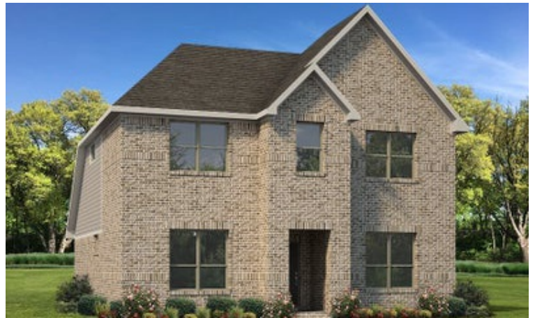
Elevation A - The Goliad