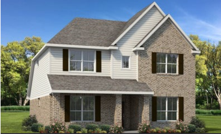
Elevation B - The Goliad