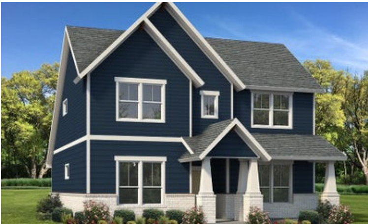
Elevation D - The Goliad