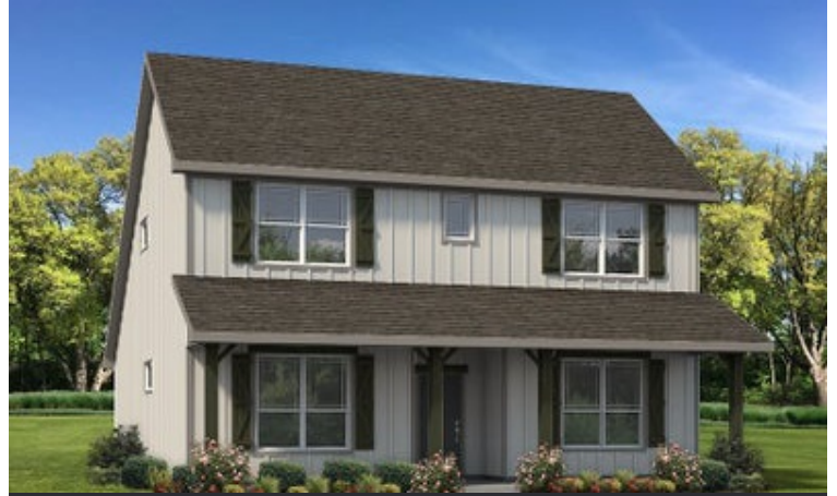
Elevation C - The Goliad