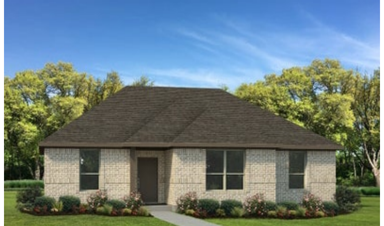
Elevation A - La Porte