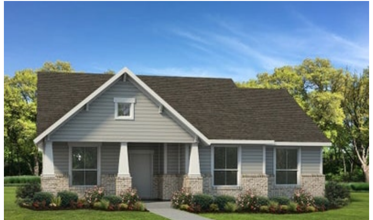
Elevation D - La Porte