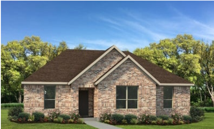
Elevation B - La Porte