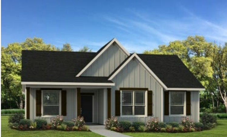
Elevation C - La Porte