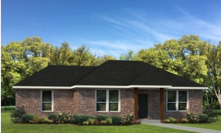
Elevation A - The Harrisburg