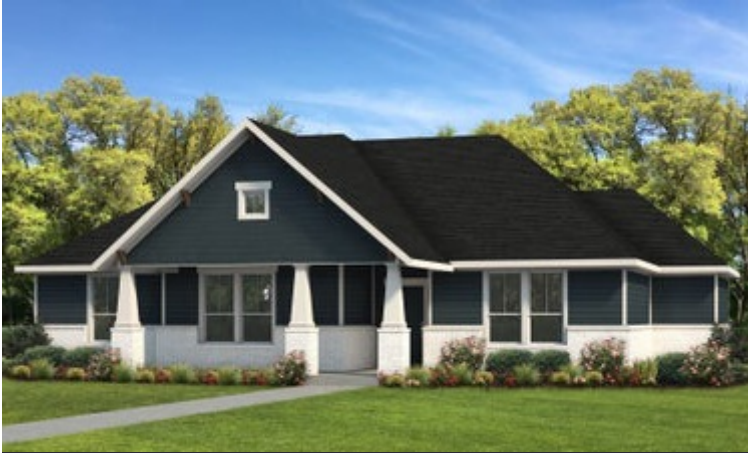
Elevation B | The Canyon