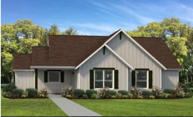
Elevation C | The Arlington