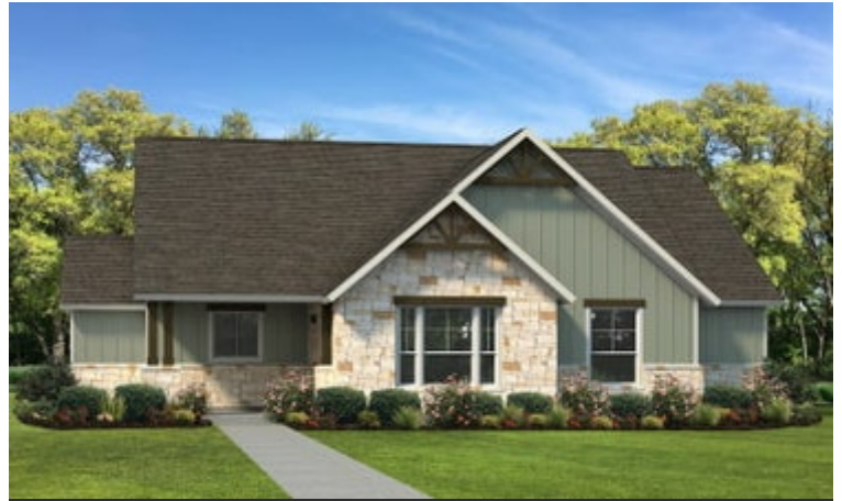
Elevation D | The Arlington