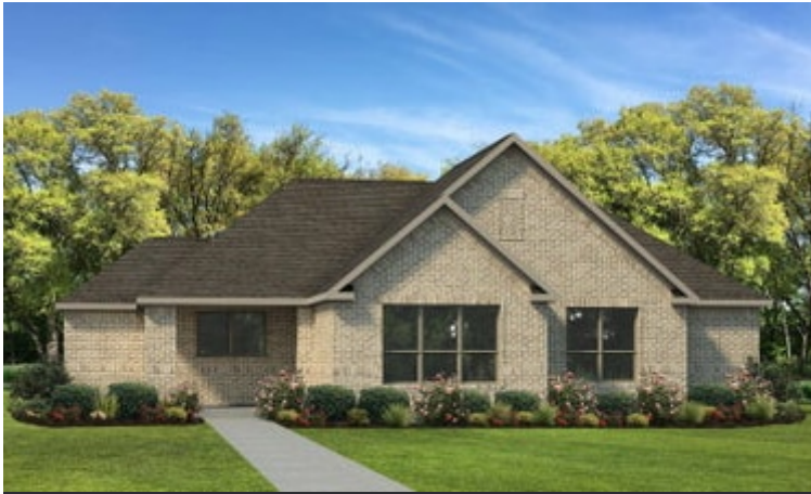
Elevation A | The Arlington