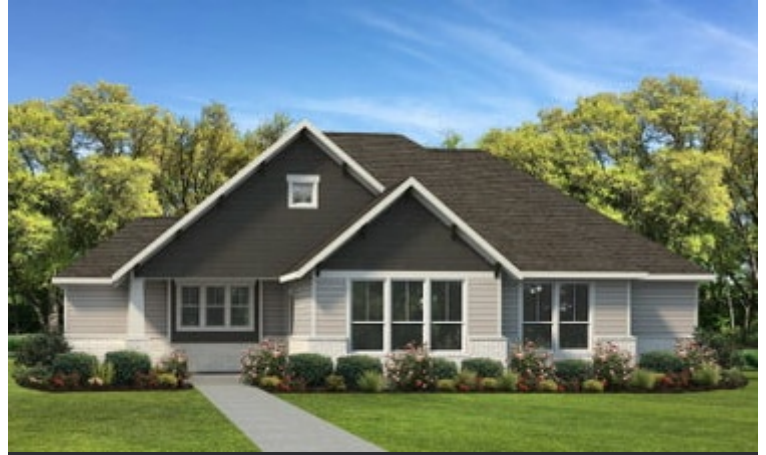
Elevation B | The Arlington